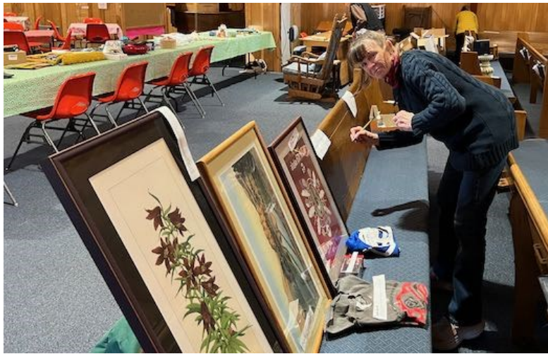
PREPARING for bazaar