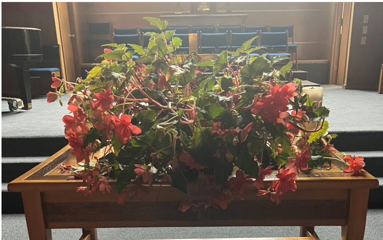
Flowers provided by Gail O'Dell