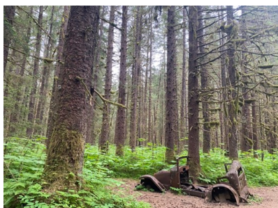
Hebert Glacier Trail